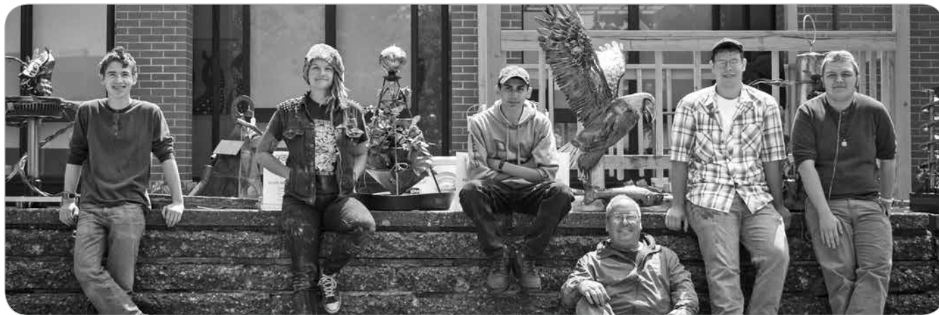
PC Welding Students

literary magazine, a display of metal sculpture from our welding program, a student film festival from the multimedia program, awards for outstanding English essays, and the ASC sponsored sidewalk chalk art contest. Details on all upcoming Peninsula College events are available at http://pencol.edu/events/all .