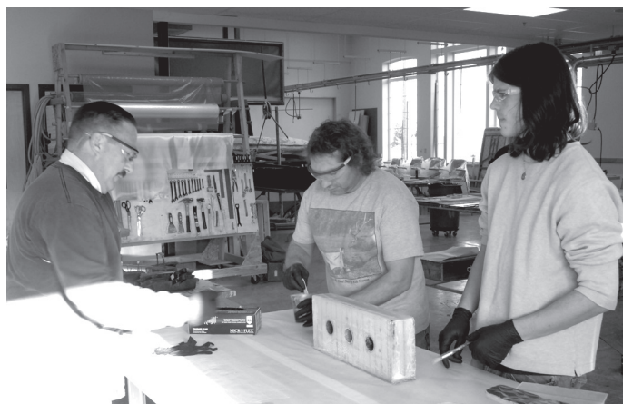
Advanced Manufacturing - Composites Technology instructor and students in the Port Angeles composites lab/shop.

To learn more visit www.PENCOL.edu/composites .