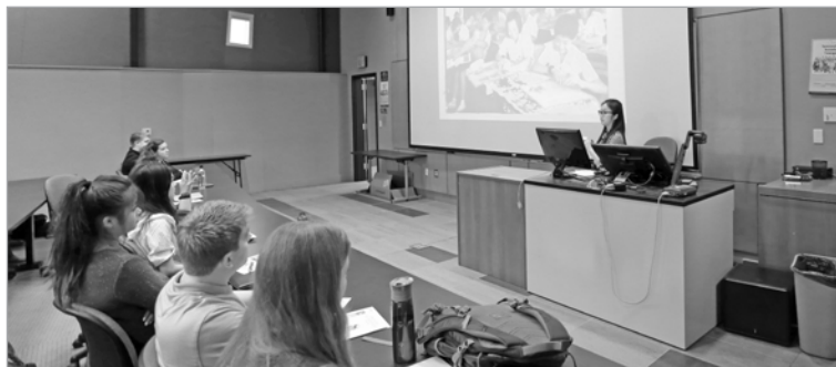
Honors students present their Capstone Projects at the annual Honors Symposium.

Work on a capstone project that you are passionate about with a faculty mentor. Our honors degree and capstone project give you an advantage when applying for scholarships and to four-year schools.