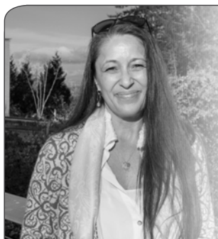
Rae Rawley Bachelors Program