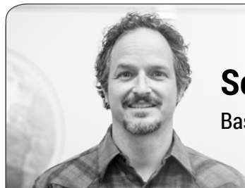
Sean Gomez Basic Education for Adults

Do you love Game of Thrones? Are you fascinated with castles, conquerors and the blood thirsty such as Genghis Khan or Vlad the Impaler? Find out how these people grabbed power or lost it, with or without dragons in History 127. This course is a comparative study of the evolution of the world's major civilizations (African, Asian, European, and American) from roughly 1200 C.E. to 1815. There will be an emphasis on understanding value systems and how they are expressed in different political, social, cultural, and religious systems.