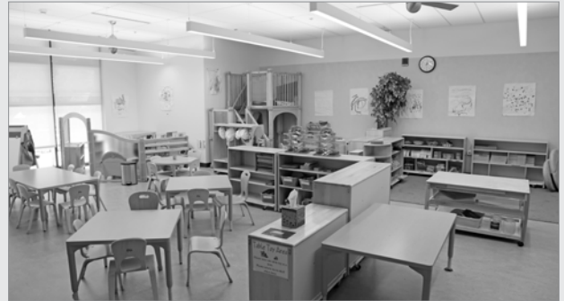
Classroom space in the Early Childhood Development Center