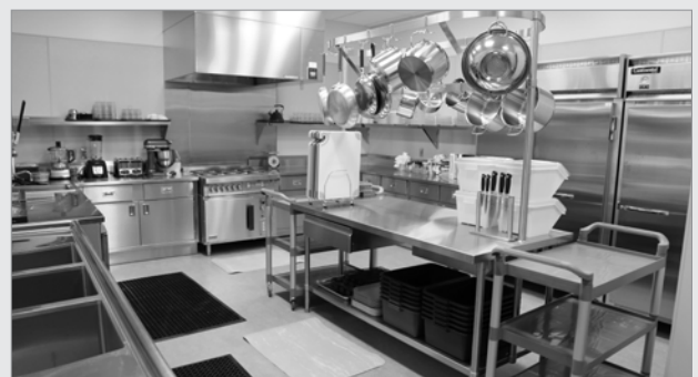
Commercial kitchen makes serving and clean up easier

The Early Achiever Grant, which covers books and tuition, is available through the State of Washington. Funds are available year-round, and the program is currently taking applications for winter quarter. Call (360) 417-6495 for more information.