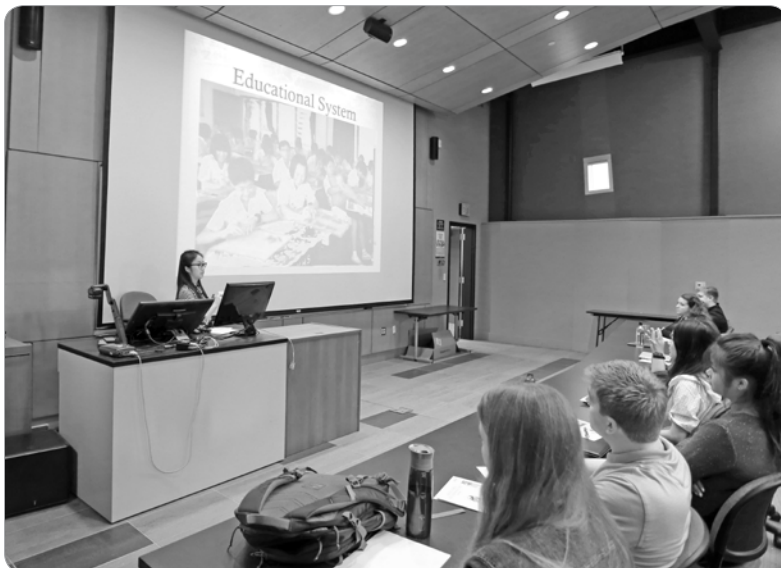
Honors students present their Capstone Projects at the annual Honors Symposium

For more information visit: pencol.edu/honors-program