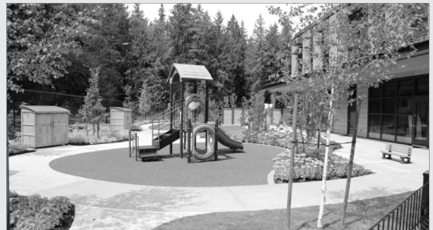
Beautifully landscaped outdoors