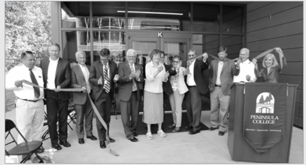
Board of Trustees dedicates new building in May 2017